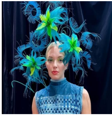
2022 Box Hill TAFE Fashion Design Students end of year runway show