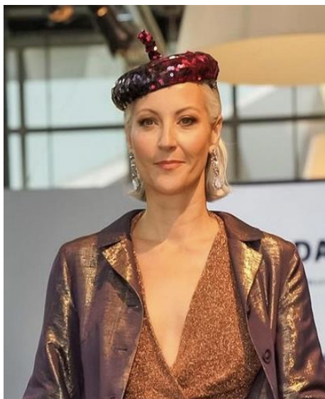
MF/W 2022 Bella Management Catwalk Show