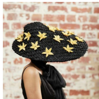
2022 MIMC Millinery Competition Top 10 finalist Theme: Little Black Dress