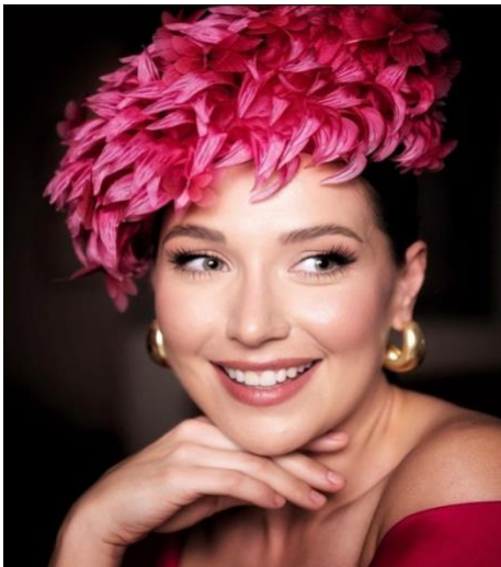
2023 Flemington VRC Melbourne Cup Carnival – Sydney Showcase