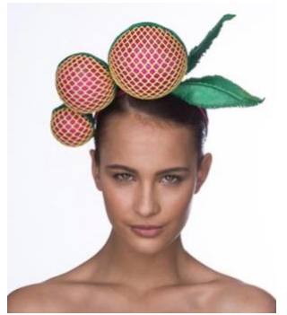
2019 Millinery Australia Members Millinery Award Theme: Cocktail