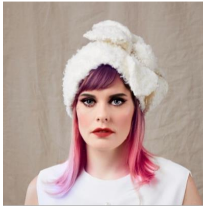
2022 MIMC Millinery Competition Theme: Derby Day 1963