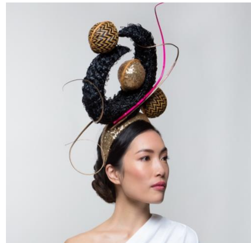
2022 Millinery Australia Members Millinery Award Theme: Counterbalance