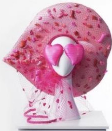
2021 MF/W “Boldly Different” lockdown showcase of Melb arts during lockdown 2021 Curated Display at Joel Gallery by Millinery Australia 2022 featured in showcased static display at Melbourne Town Hall