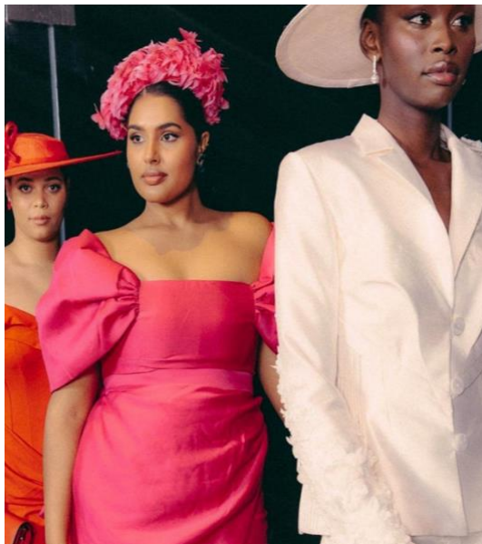
2023 Flemington VRC Melbourne Cup Carnival Spring Gala Runway - Melbourne