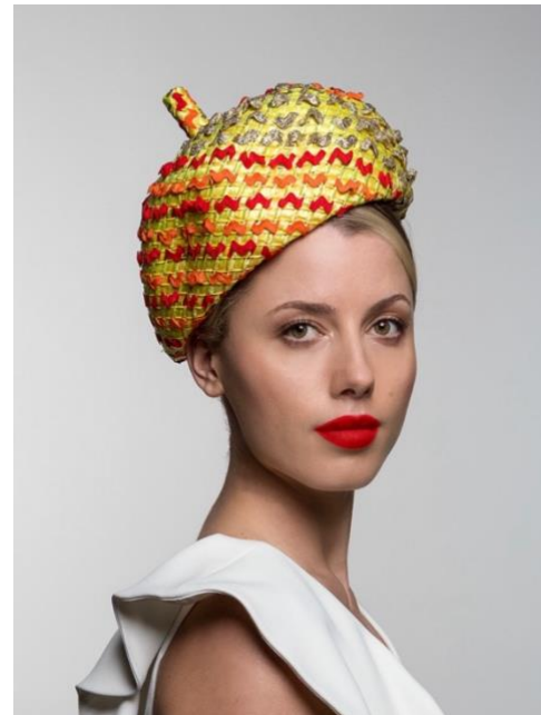
2023 Millinery Australia Members Millinery Award Theme: Ruffled