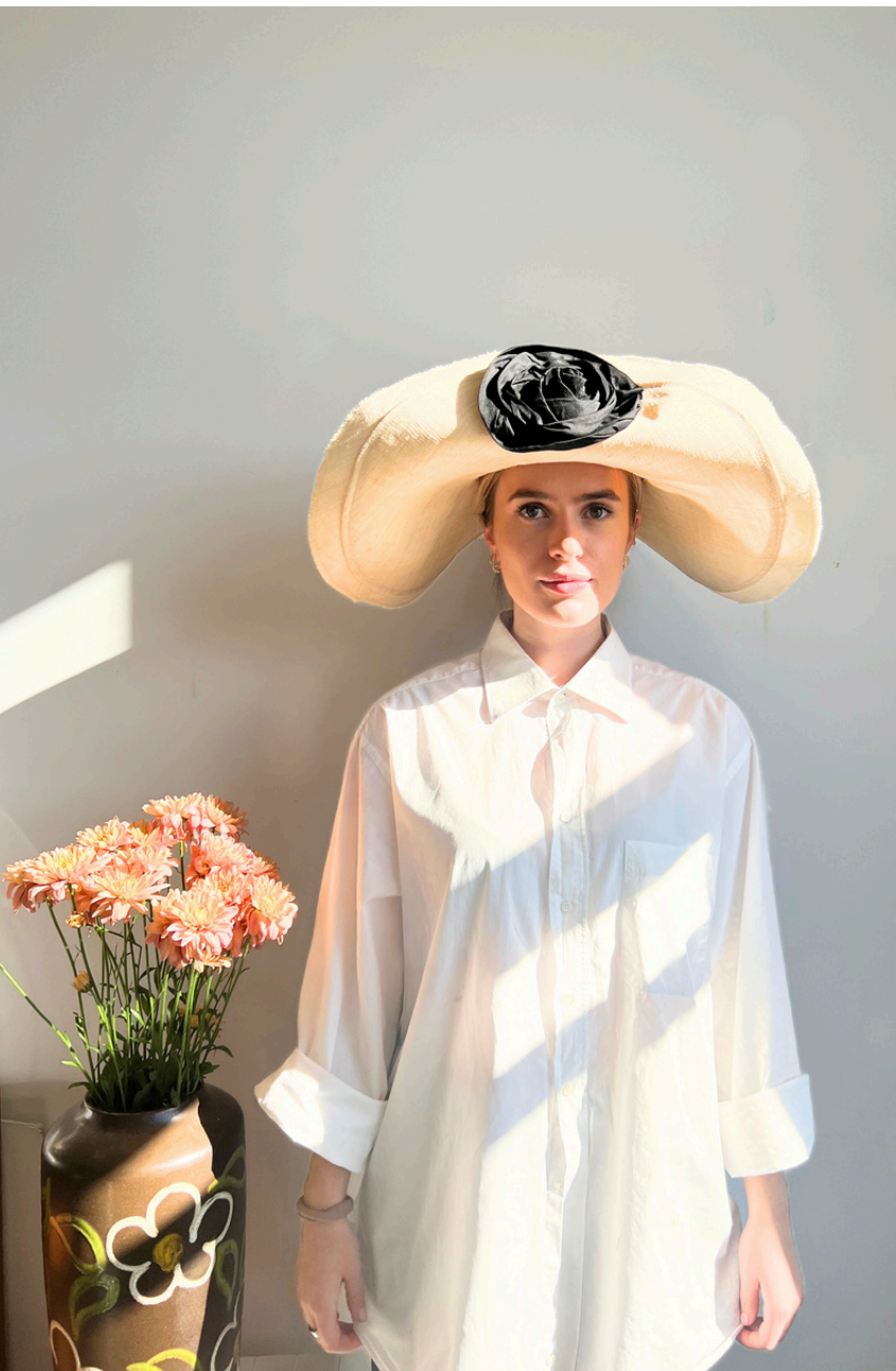
The Mira Hat