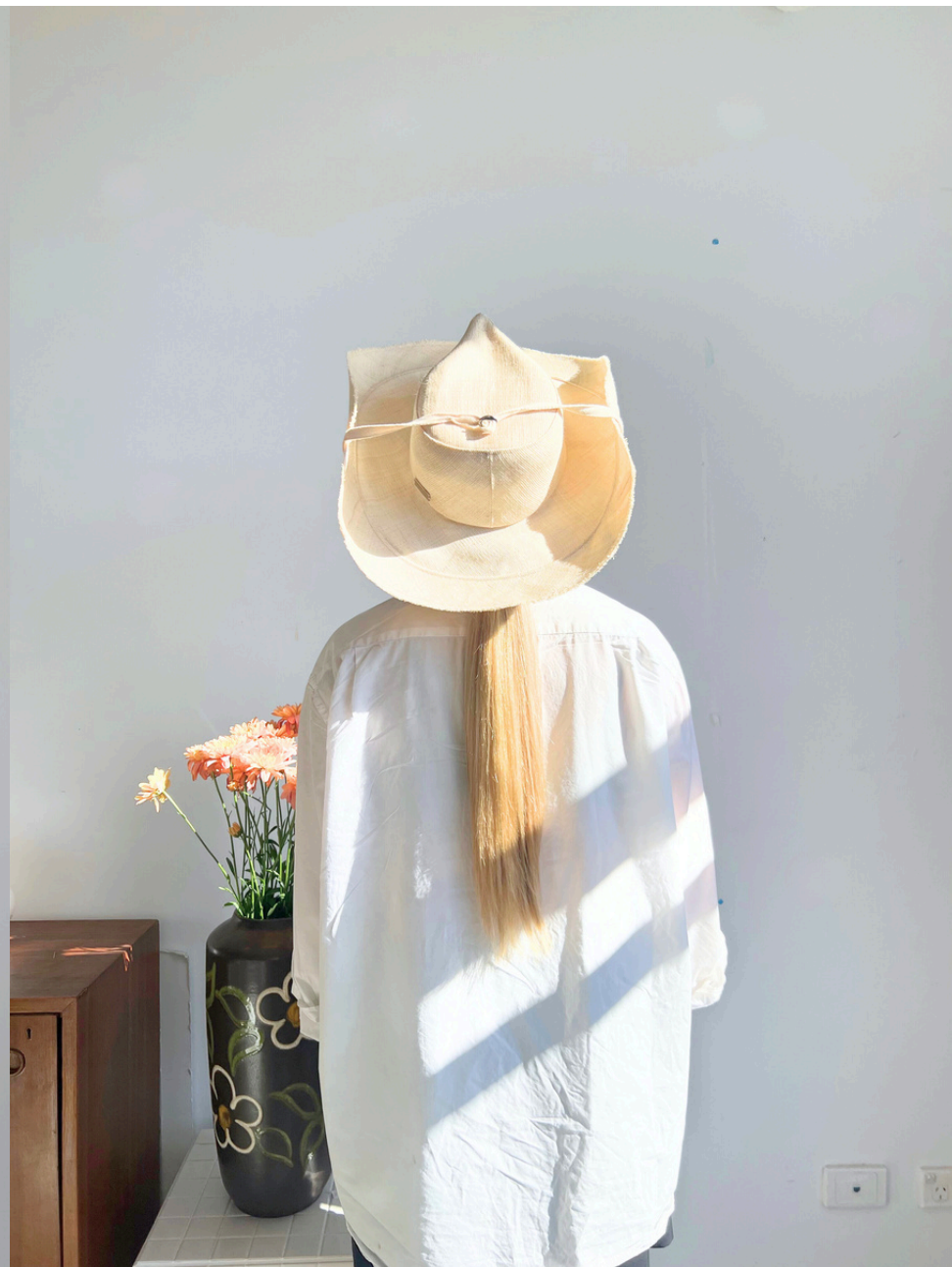
The June Hat