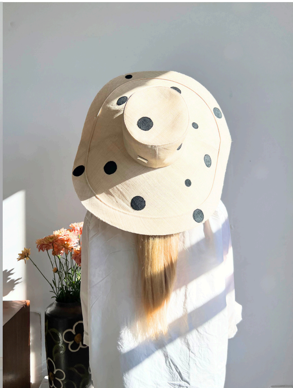
The Franco Hat