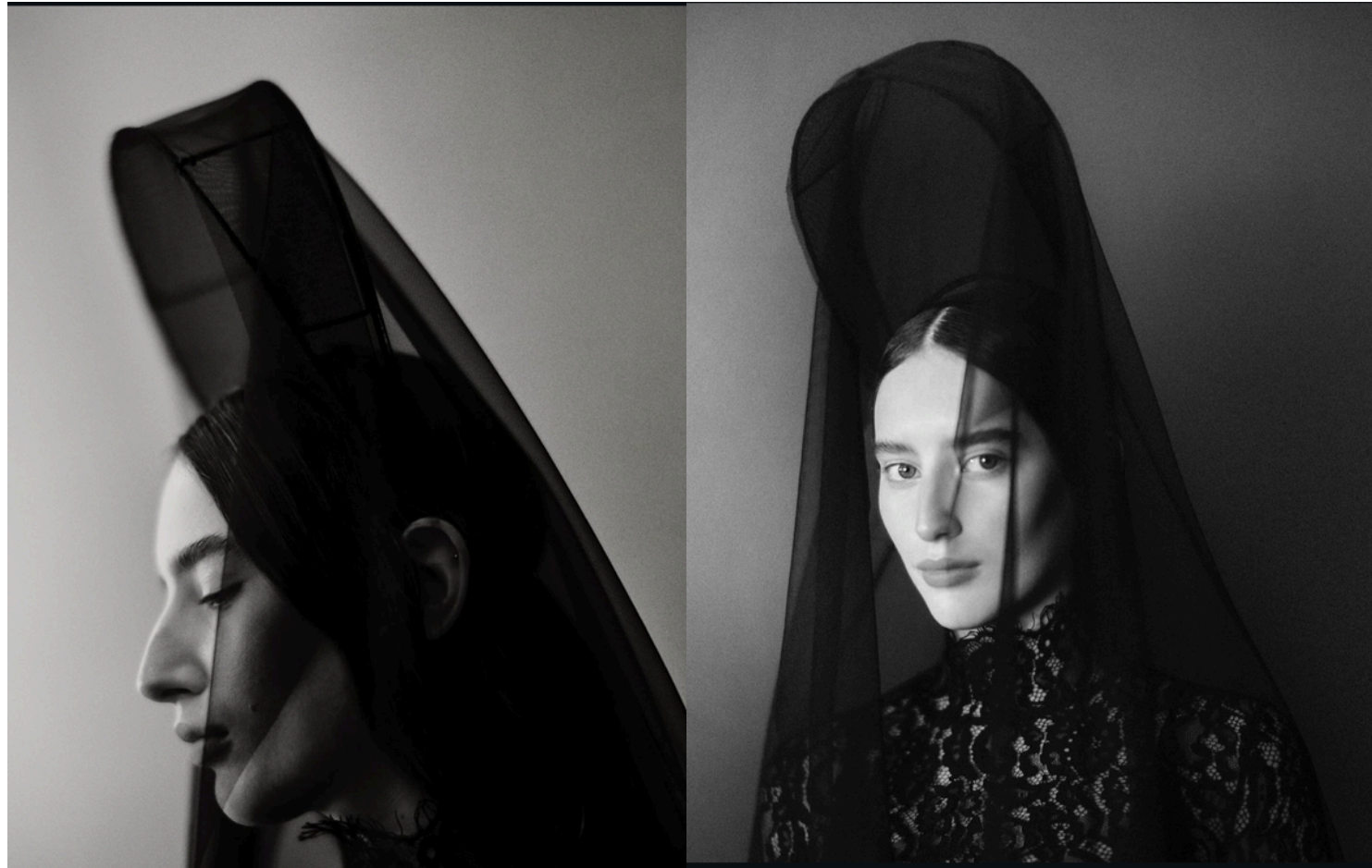
Custom pieces for Interwoven Show