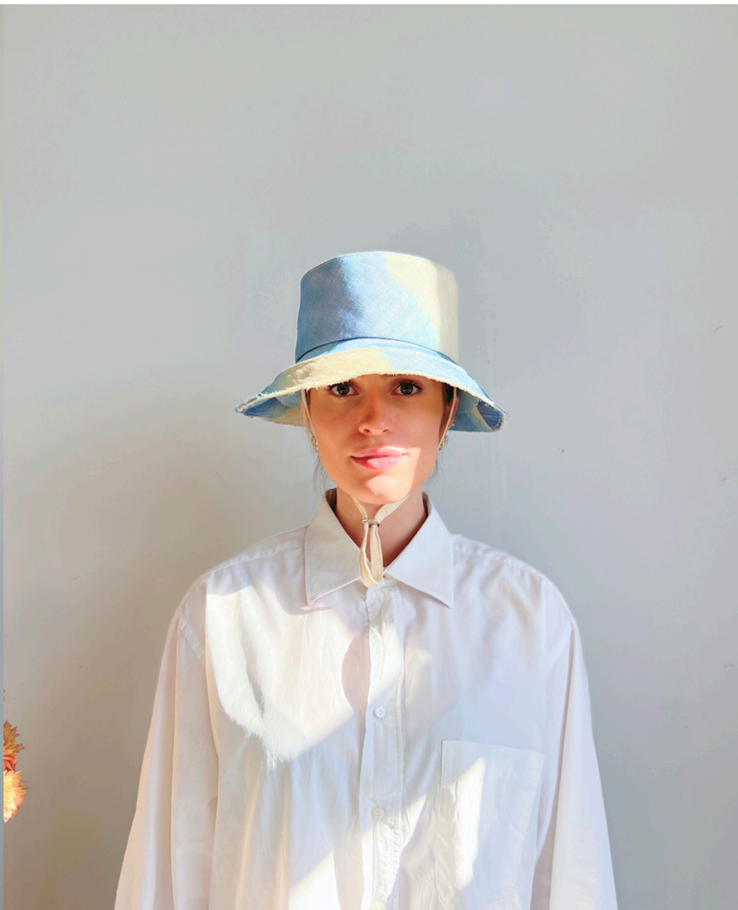
The Cole Hat